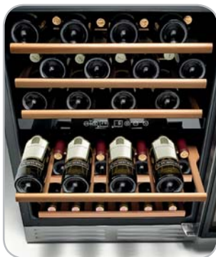
SOAVE / SALENTO